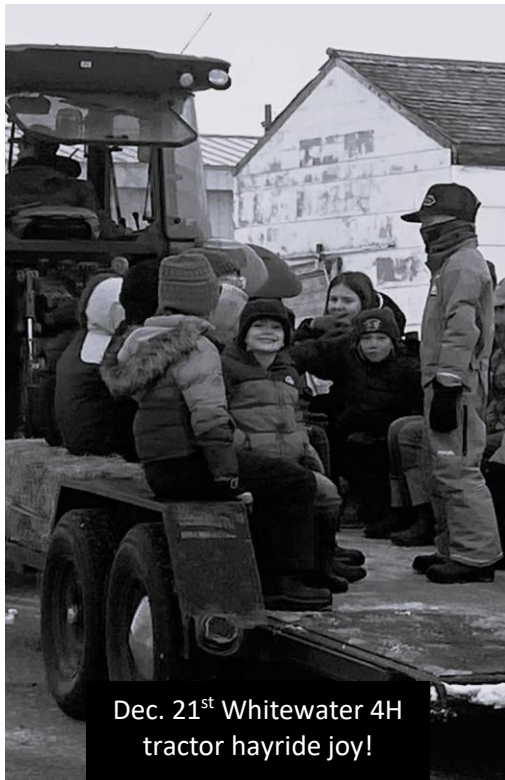
Dec. 21 st Whitewater 4H tractor hayride joy!